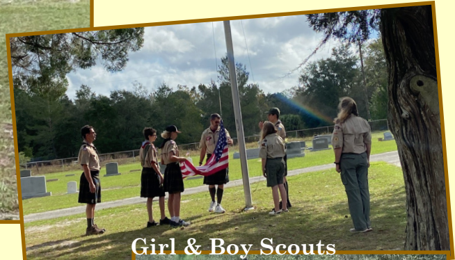
Girl & Boy Scouts